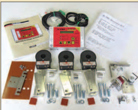
AC-PRO retrofit Kit for G.E. AK-2-25

The AC-PRO can be supplied as part of a complete retrofit kit. Kits include all necessary brackets, mounting hardware, wiring, actuator, and installation documentation and instruction manuals.