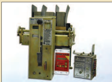
Direct Replacement of a Static-Trip II on a Allis Chalmers LA-600 breaker

Reusing the existing CTs and actuator can greatly reduce material costs and cuts installation time to a fraction of that required for a complete retrofit.